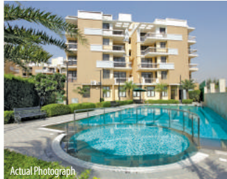
Eldeco Mystic Greens Sector Omicron-1, Greater Noida