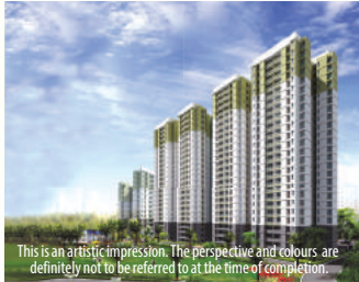
Eldeco Inspire Sector 119, Noida