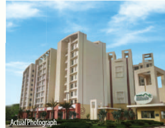
Eldeco Hillside Japanese Zone, Neemrana