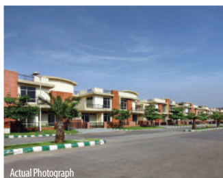
Eldeco County Sector 19, G.T. Karnal Road, Sonapat