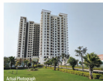
Eldeco Accolade Sector-2, Sohna, Gurgaon

The Eldeco Group has been at the forefront of Real Estate development in North India since 1985. The group is synonymous with timely and quality delivery in a number of cities like Lucknow, Kanpur, Agra, Noida, Greater Noida and other parts of Delhi-NCR. With more than 30 years of expertise in construction and real estate development, Eldeco has delivered more than 175 projects spanning townships, high-rise condominiums, industrial estates, malls and office complexes. In addition, 30 projects are in various stages of active execution. The aggregate delivered area stands at more than 20 million sq.ft. with more than 25000 satisfied customers. Currently, apart from the towns mentioned above, Eldeco is developing projects in Panipat, Sonapat, Ludhiana, Jhansi, Neemrana and Jalandhar. The unique 1200 acres state-of-the-art Eldeco Sidcul Industrial Park at Sitarganj, Uttarakhand is Eldeco's flagship project in the industrial sector.