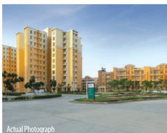
Eldeco Eden Park Japanese Zone, Neemrana